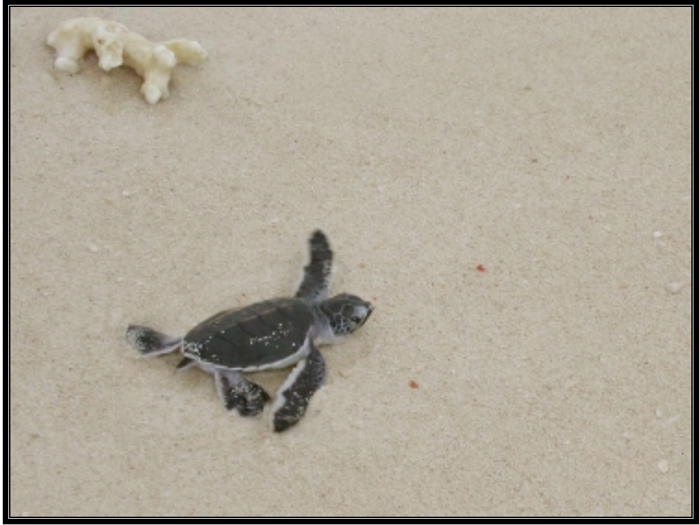
Green Turtle hatchling, Selingan Island

Shortly after 8pm we were called down to the beach to see a Green Turtle lay her eggs in the sand. People are banned from the beaches from dusk onwards not to frighten the turtles and we were only permitted to see, with a warden, once she had started laying and just for a few minutes. Once this was over the warden took us, and a group of turtle hatchlings down onto the beach where we released the turtles watching them scurry down the beach, flippers flying, into the sea. I wished them good luck. They wouldn't be back for at least 30 years!