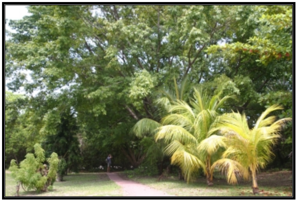
Ficus sp., (source: Selingan Island, Sabah, Borneo)

What is so fascinating about the Strangler Figs is their versatility. In the wild, Strangler Figs grow from the top down using a host tree. However, in cultivation it is possible to plant a Strangler Fig and it will develop from the ground upwards just like 'conventional' trees.