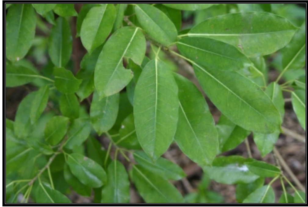
Ficus sp., (source: Selingan Island, Sabah, Borneo)'

As we got on the boat we were warned about the fines and prison sentences we would face if we took anything from the island. We then found out that this group of islands was one of the most heavily protected parts of Malaysia. I started to feel sick. I casually kicked my legs onto my bag protecting my sample and smiled as my stomach began to sink. Surely, this couldn't apply to just the tiniest tree specimen? It couldn't infect other areas as it was in 90% alcohol.