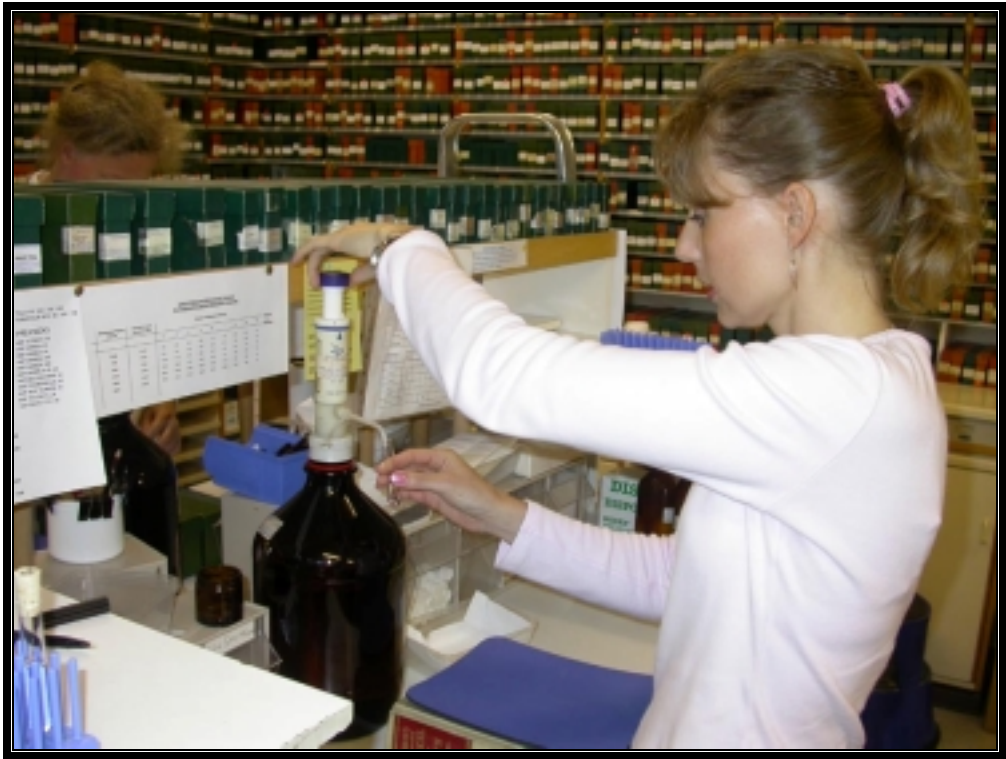
Author at Helios Homoeopathic Pharmacy in Kent

I was shown a space on a bench where I was given glass vials, a rack for storing the separate potentised vials, an alcohol filled dispenser, which neatly discharged exactly 99 drops of alcohol into each vial and of course a large book for succussion. I was given plenty of friendly instruction before we started.