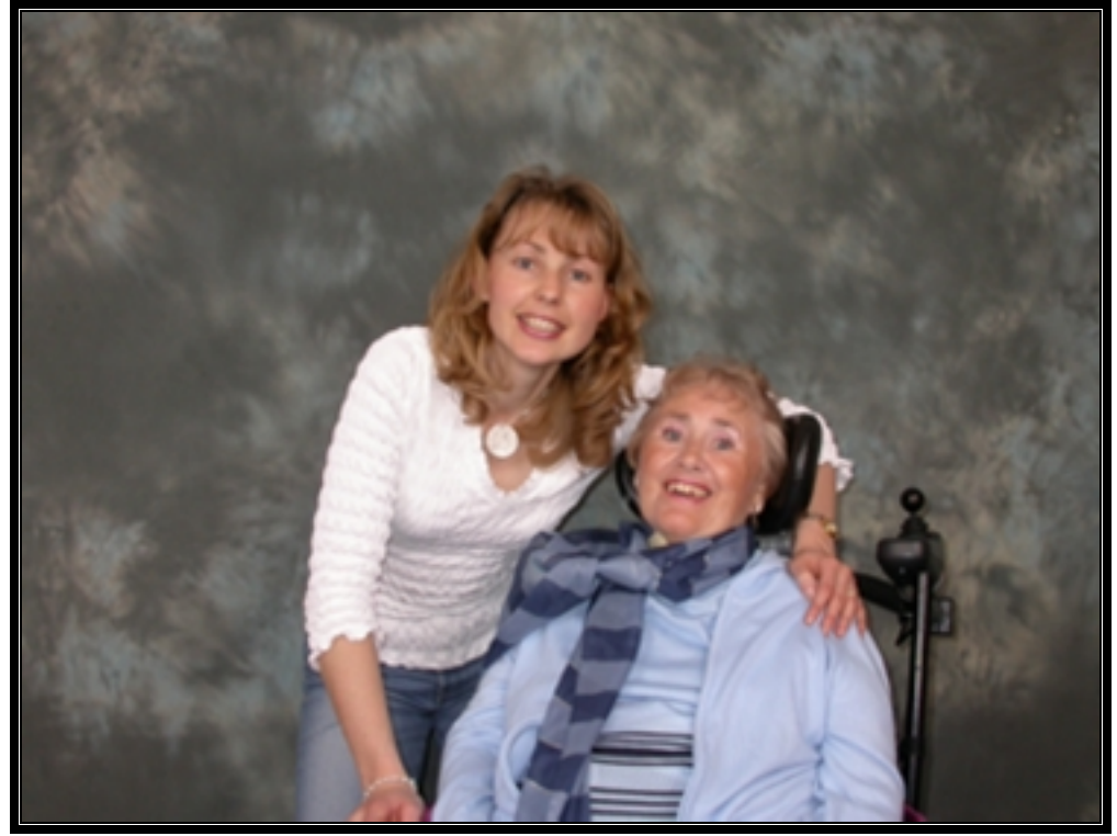
Author & Mother 2003

This work is dedicated to my mother, the most courageous person I know.