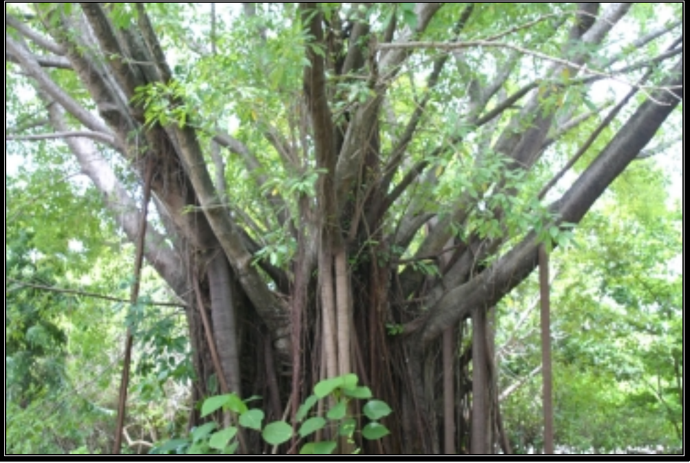
Ficus sp., (source: Selingan Island, Sabah, Borneo)'

These highly successful trees, though bringing such wealth to the rainforest ecosystems, can also be very destructive. According to Paul C. Standley (Flora of Yucatan, 1930), they are also a major factor in the destruction of Mayan cities. The seeds, which have been dispersed by animals, can also germinate in cracks in walls and buildings. The powerful roots will reduce ancient walls to rubble in a relatively short period of time. Many ancient cities are partially or completely covered by the Strangler Figs. In Guatemala, the wonderful pyramids of Tikal resemble islands of stone in a verdant sea of tropical forest. A steep trail ascends one of the tallest pyramids, winding through a mass of fig roots, which serve as convenient steps and handrails.